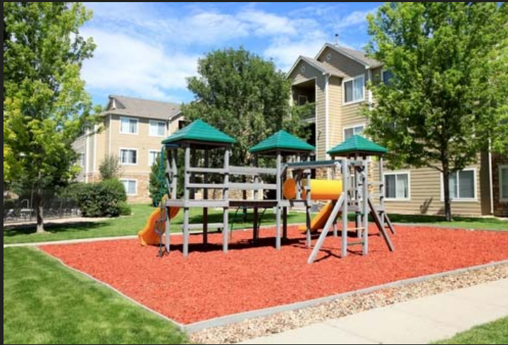
Reserve at Northglenn · Northglenn, CO

We improve communities and create investor value through the acquisition and preservation of affordable housing. We utilize a variety of funding sources and execution strategies to meet the needs of traditionally underserved populations. Our success has been driven by a collaborative approach that leverages the creativity and expertise of our own team, as well as that of our public, private, and non-profit partners. We are proud to continue Security Properties' 48-year tradition of giving back to the communities in which we operate.