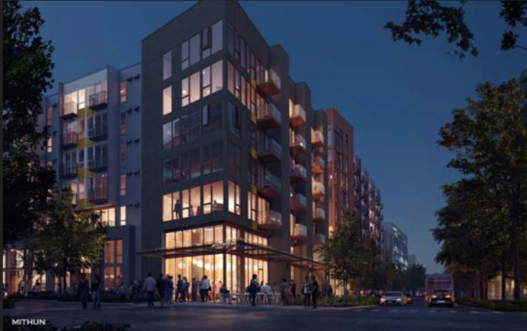
Sparc • Bellevue, WA

We strive to create a sense of unity and ownership among residents, retail partners, and the greater community. We approach development with a long-term perspective, promoting sustainable construction practices and the creation of a unique sense of place and identity for our residents. We attribute our success to a collaborative, team-based approach with a strong group of long-term outside consultants, including architects, engineers, and general contractors.