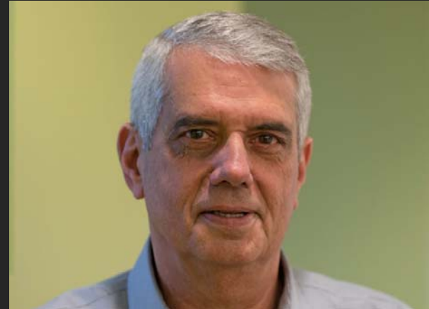
Chief Financial Officer