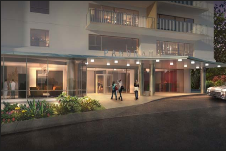
Panorama House • Seattle, WA

Security Properties has more than 48 years of experience with the oversight and management of multifamily assets and the stewardship of capital for over 20 institutional investors and thousands of private investors. We have managed a variety of asset types, including market rate and affordable properties, the latter subject to numerous regulatory agreements and compliance requirements.