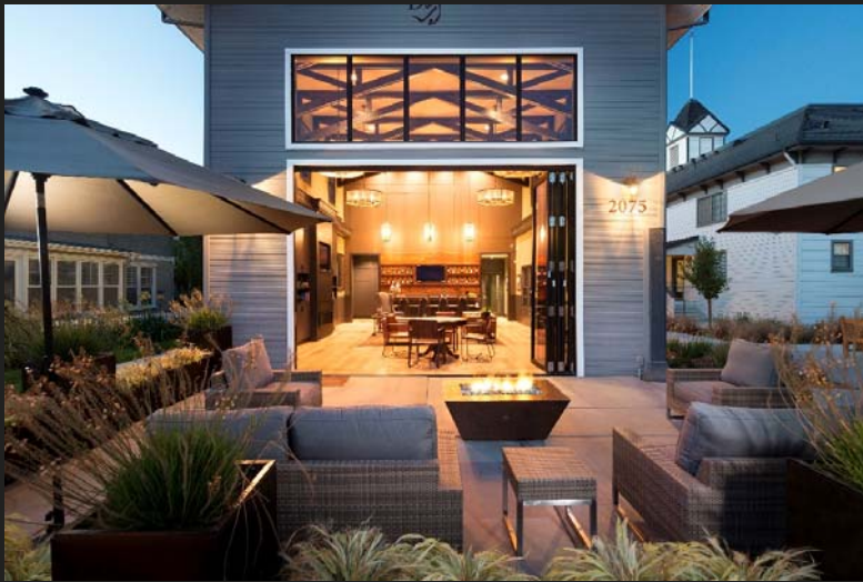
Saratoga Downs • Napa, CA

We purchase core-plus, value-add, and opportunistic multifamily assets that produce attractive investment returns. We seek deals that are either off-market or thinly marketed, and that have significant upside potential through physical enhancements or improved management.